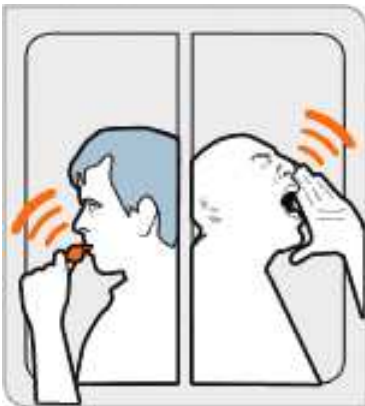
If you spot terrorism, blow your anti-terrorism whistle. If you are Vin Diesel, yell really loud.