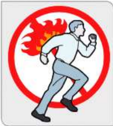
If you have set yourself on fire, do not run

The fun thing is that these pictures are so ambiguous they could mean anything! Here are a few interpretations.